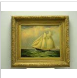
Oil Canvas, Sail Ship on Sea