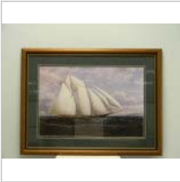
Schooner on the Sea

38 1/2 x 28 Wood Frame, 10 lbs, 1" depth