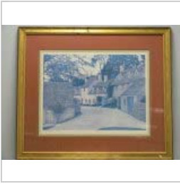
English Cottages, faded, Tom Caldwell, print # 525/950