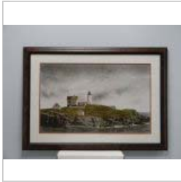
House & Lighthouse