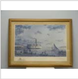
Chesapeake Bay Harbor, Enoch Pratt bound for Baltimore in 1889, Paul McGehee, print # 81/950

42 x 28 1/2 Wood Frame, 11 lbs, 1" depth