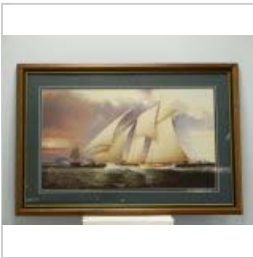
Schooner in Harbor

33 1/2 x 26 Wood Frame, 8 lbs, 3/4" depth