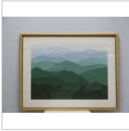
Jack Rollins '79 Landscape III, print # 20/30