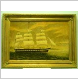
Oil Canvas, Tall Ship, J. Glaguer

49 x 39 Gold Wood Frame, 16 lbs, 3" depth