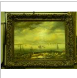
Oil Canvas, Harbor Scene by Valerio

35 x 32 1/2 Gold Ornate Frame, 14 lbs, 4" depth