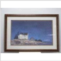
Silent Night Silo & Barn