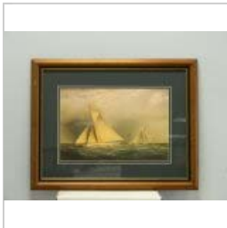
Sailboats at Sea

33 x 29 1/2 Red Oak Frame, 9 lbs, 1" depth