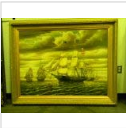
Oil Canvas, Ships in Harbor by Valerio (30 lbs)

46 x 44 Ornate Gold Frame, 21 lbs, 2" depth