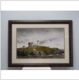
House & Lighthouse

38 3/4 x 29 Gold Wood Frame, 10 lbs, 1 1/2" depth