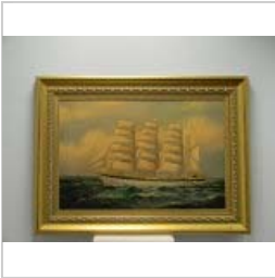
Oil Canvas, Tall Ship by Matt Thomas

44 x 33 Gold Wood Frame, 14 lbs, 3" depth