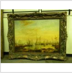
Oil Canvas, Shipyard Scene by Valerio

36 x 40 1/2 Gold Frame, 16 lbs, 1" depth