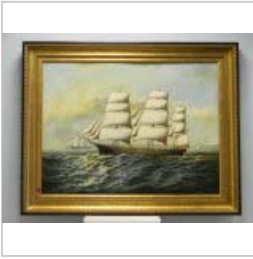
Oil Canvas, Sailing Ship at Sea