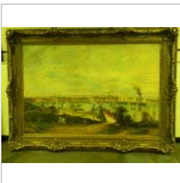
Oil Canvas, Harbor and Village by Valerio

42 x 29 Wood Frame w/ Gold trim, 12 lbs, 1 1/2" depth