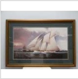
Schooner and ships on choppy seas

43 1/2 x 31 1/2 Wood Frame, 12 lbs, 1" depth