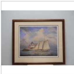
Lighthouse & Ship, Melvin Miller Print, print # 464/750

London - 31 x 24 Wood Frame, 7 lbs, 1" depth