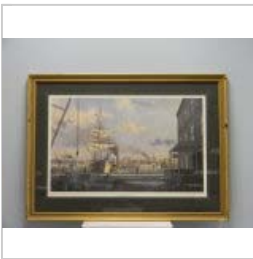
Morning Arrival at Baltimore, signed, print # 100/950

42 x 28 1/2 Wood Frame, 11 lbs, 1" depth